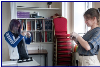
Cork Life Centre prepare perspex for their protective visors.

"At what has been a stressful time, it has been so heartening to see how communities, and those who support them, have come together. In our lovely home on Winter's Hill in Cork, behind the red door, work is well under way in preparation for safe re-opening for a new school year. This would not be