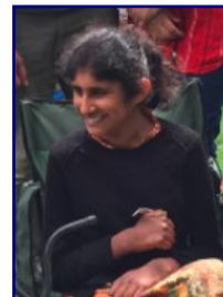
Iman received £1,610 towards a non-slip wet room flooring.