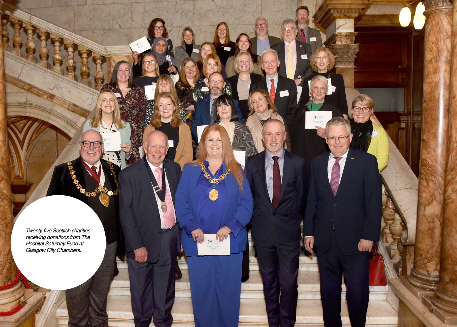
Twenty-five Scottish charities receiving donations from The Hospital Saturday Fund at Glasgow City Chambers.