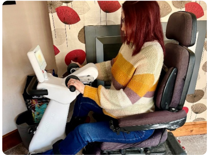
New MOTOMed LOOP LA Arm/Leg motorised device.

"I was absolutely over the moon when I received the grant approval from The Hospital Saturday Fund! I really can't put into words how much this means to me. Having FSH Muscular Dystrophy is exhausting both physically and mentally, and as there are currently no treatments available, it is so important to keep as physically active as possible. Now I just pop my music on loud, pedal away, and afterwards I use the arm function. I can feel the physical benefits straight away - my arms and legs feel warmer and less achy, my heart rate is elevated, and feel so much happier and content knowing I'm doing something to help myself. Thank you so much and keep up the great work."