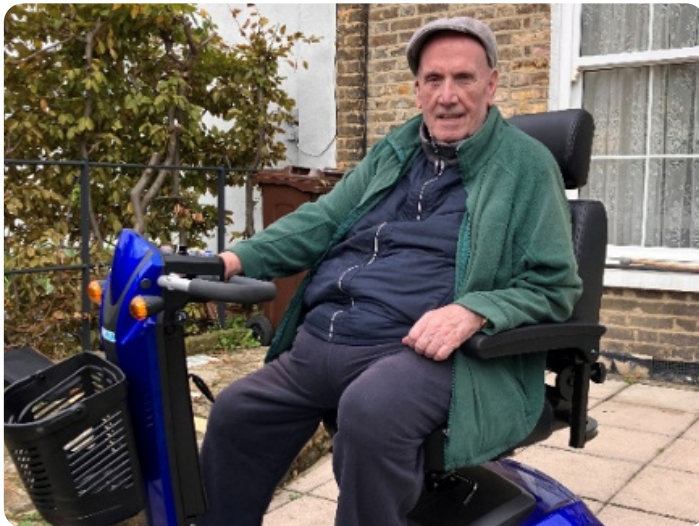
A mobility scooter is life-changing for someone who was previously housebound.

With a history of falls, alongside conditions such as COPD, sciatica, arthritis, hypertension, liver disease, and heart disease, using public transport had become increasingly challenging and risky for this individual. Thanks to a £695 grant towards a mobility scooter, he has regained the independence he so deeply craved, enabling him to safely reconnect with the community he loves, as you'll see below.