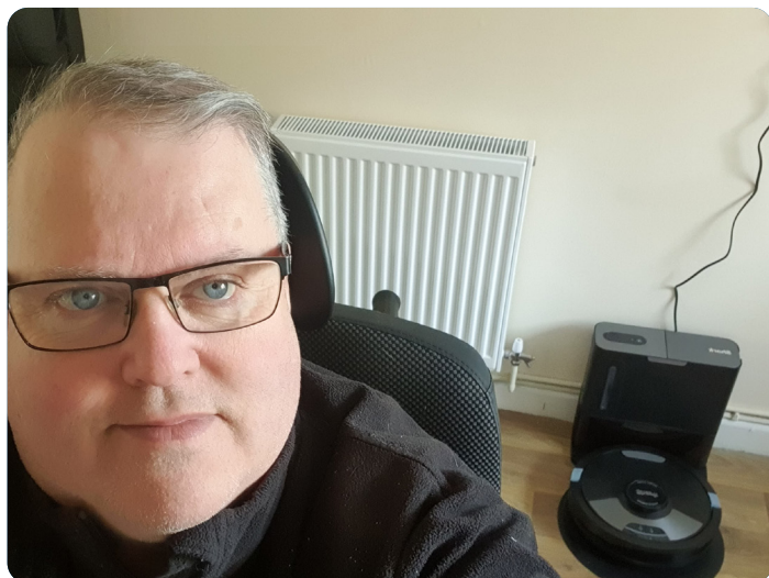
The robot vacuum cleaner significantly reduces the time and effort spent on cleaning, helping conserve energy for other tasks.

Following a sailing accident in 2022, the individual sustained a C6 incomplete spinal cord injury, resulting in left-sided paralysis and the need to use a powered wheelchair. He applied for a robotic vacuum cleaner to help manage household cleaning, as the repetitive shoulder movements required for tasks like sweeping and vacuuming worsen his injury, triggering spasms and ongoing pain.