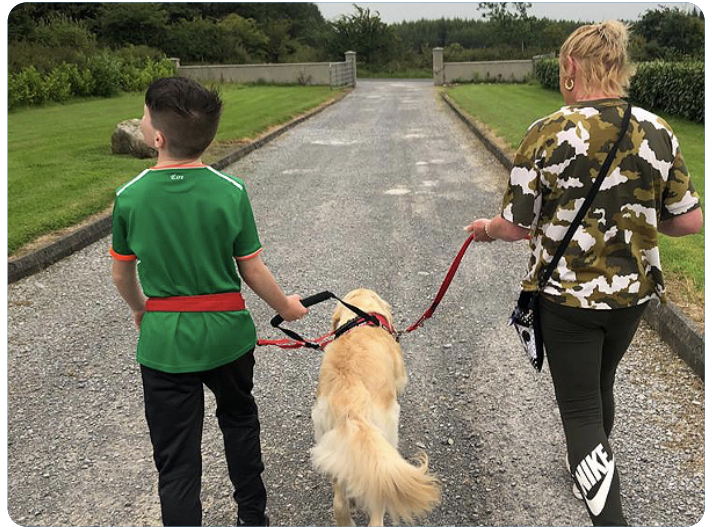
Autism Assistance Dogs Ireland provides enormous support to their child partners and raises awareness about autism within the local community.

The €4,000 grant will go towards essential equipment upgrades at their headquarters in Little Island, Cork. This upgrade includes the purchase of four Lenovo IdeaPad 3 laptops and one pre-owned iPhone 11. These items are crucial for enhancing our administrative efficiency and communication capabilities, which are vital to supporting our core mission of providing life-changing assistance dogs to children with autism.