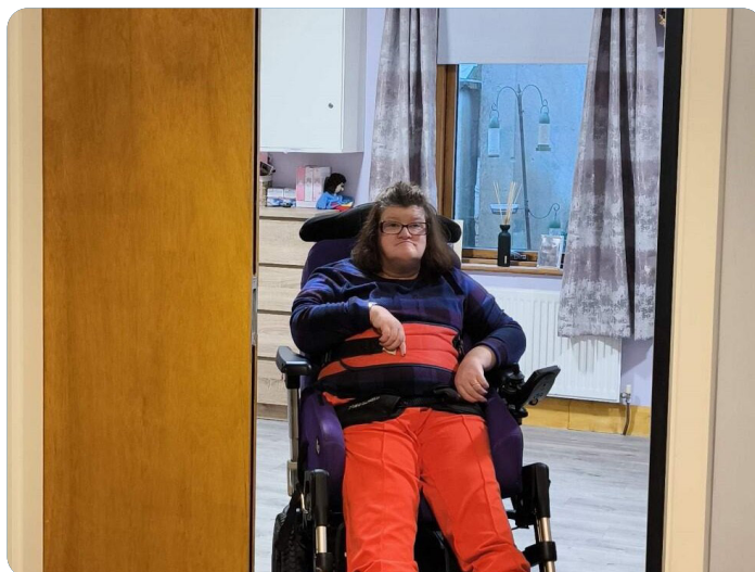
Purchased installation of automated doors, providing independent access between the bedroom, ensuite, and the rest of the home.

“Please find a photo of the funded accessible door. Many thanks to The Hospital Saturday Fund for providing the funds to install this door. It has made a significant difference to the person’s independence in her own home.”