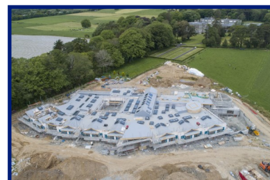
Work in progress at Wicklow Hospice.

Earlier this year, Wicklow Hospice were awarded €3,000 by HSF towards the building of the new hospice. After 10 years of fundraising they will open their doors to a 15 bed hospice with a palliative care team attached by the end of 2019.